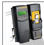
MicroDock II compatible