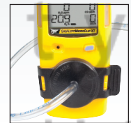
Simple calibration and bump testing