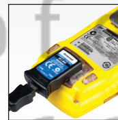
Easily download datalogged info