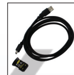
IR connectivity kit