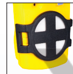
Auxiliary filter kit