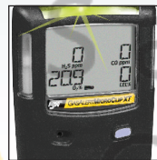
Black housing available