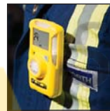
Easy To Wear