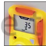
Easy to See