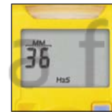
Easy to Read