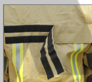
Detachable Back Writing (wit