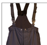
Extra High Waist