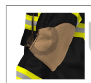
Pre-bent Ergonomic Elbows