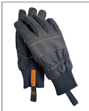
PENKERT BASIC GRIP SHORT Fir