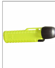
PAB Helmet Mounted Lamp