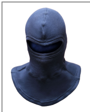
FYRHOOD® 50 Knitted Fire Hoo