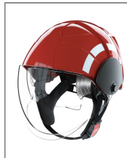
PAB FIRE COMPACT Fire Fighti