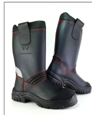
TUFFKING F2A Fire Mobil Leat