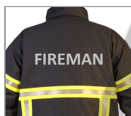
Grey Reflective Back Writing