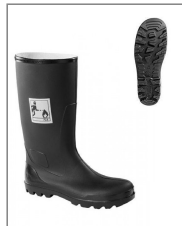
Etche Rubber Fireman Boots