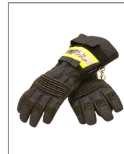
SEIZ Premium Fire Fighting G