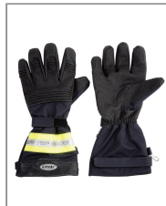
CHIBA Top Rescue Fire Fighti