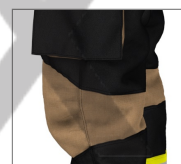
Pre-bent Ergonomic Knees