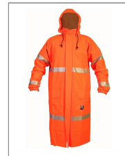
PROS Fireman Raincoat